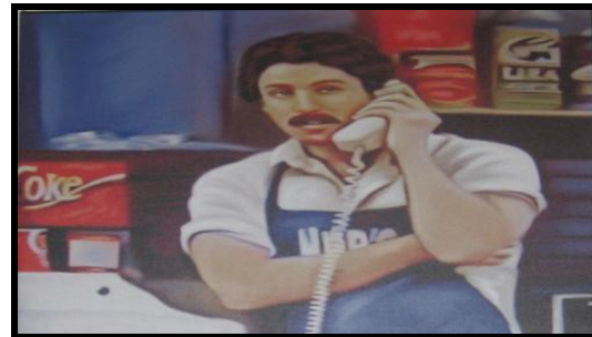
-SNL Skit '93

(served on light rye with cheese, grilled onions and pickles)