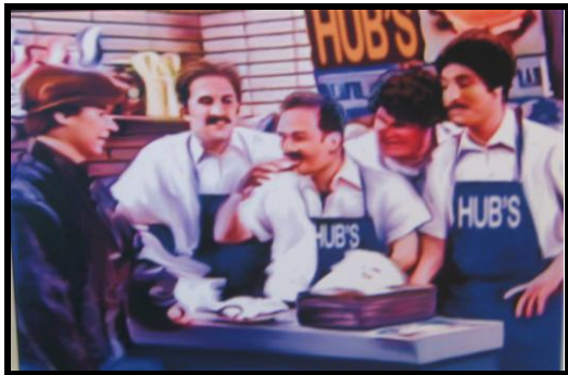
You like it the Greek, Ah?

DOLMATHES 10.35 (Grapevine leaves stuffed with ground beef and rice, topped with homemade lemon sauce; served with rice or oven potato and your choice of vegetable and bread.)